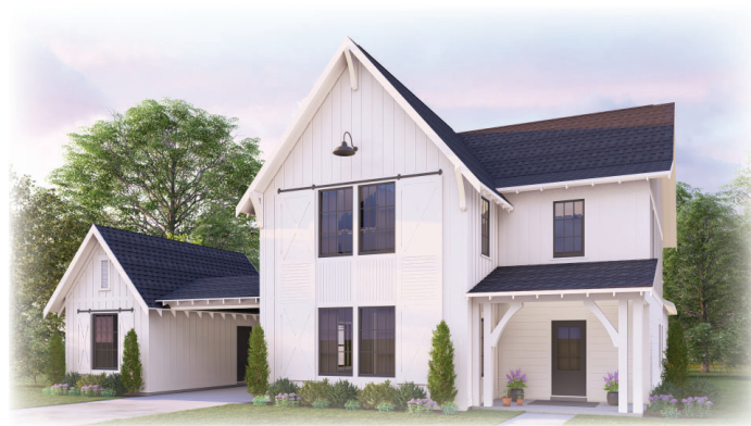
Elevation D with Porte Cochere