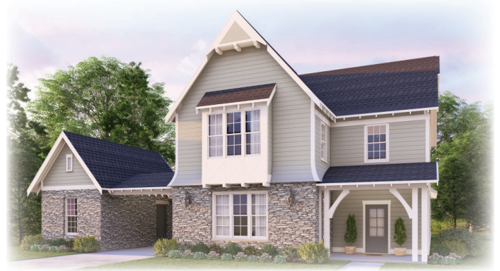
Elevation A with Porte Cochere Elevation C with Porte Cochere